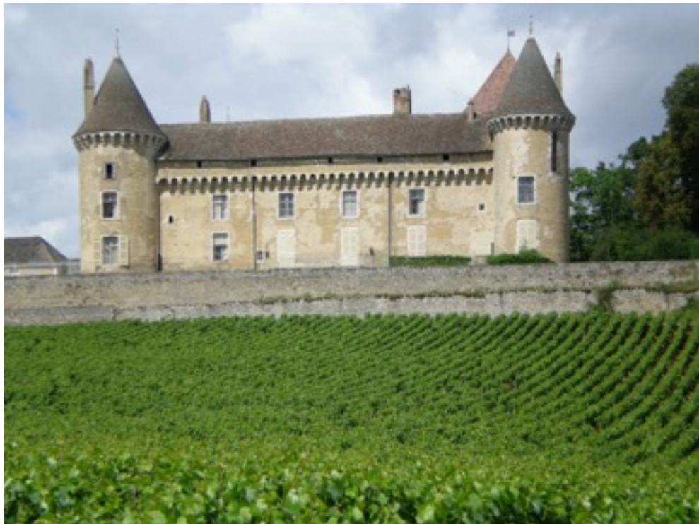
The Chateau de Rully

This is really quite gorgeous for the $$ - well-crafted, nice purity and precision of flavors, and a nice mineral edge to it as well. Yes, please!